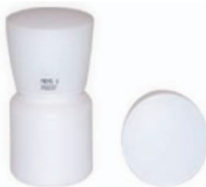
■ Figure 1. MEMS Caps

MEMS indicates Medication Event Monitoring System.